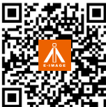
E-IMAGE Official QR Code

Visit www.eimagevideo.com for more information